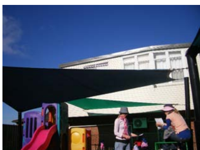
New larger sails in the climbing area

After the events of 8 June when we thought the whole of Newcastle (including us!) would get washed away and our playground would never see the sun again - it stopped raining!!!! We haven't had too much time outside lately, but we are very happy with the new shade structures and feel they will really help our back playground come summer time, be a much cooler space for the children.