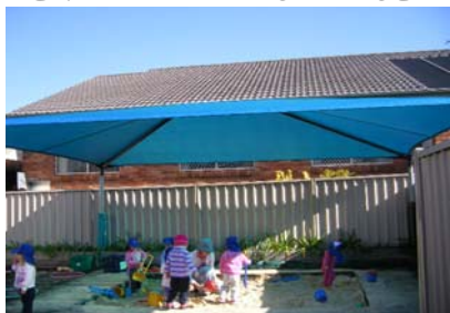
New sandpit shade cover

After the events of 8 June when we thought the whole of Newcastle (including us!) would get washed away and our playground would never see the sun again - it stopped raining!!!! We haven't had too much time outside lately, but we are very happy with the new shade structures and feel they will really help our back playground come summer time, be a much cooler space for the children.