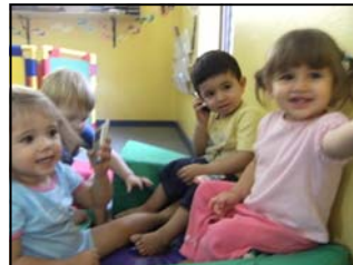
Baby team meeting discussing the quality of their care..verdict is HIGH!!

Once we have our paperwork, formal feedback and rating returned to us we will publish the information for parents to read.