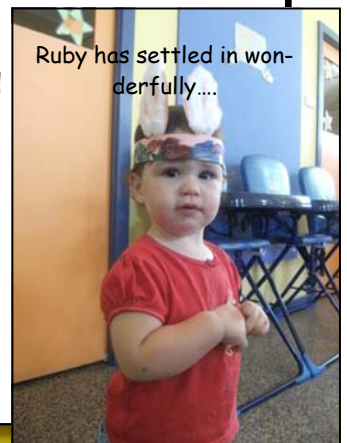
Ruby has settled in wonderfully....